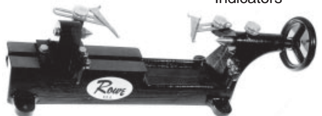
Fully assembled flywheel truing stand ready for use.

You are ready to use your new Rowe USA Flywheel Truing Stand.