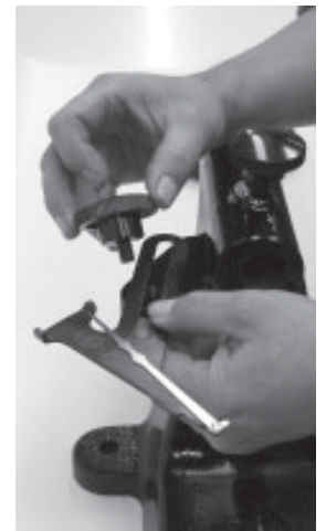
Fig. 4 Installing Indicators