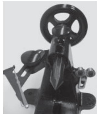
Fig. 3 Correctly Installed Center